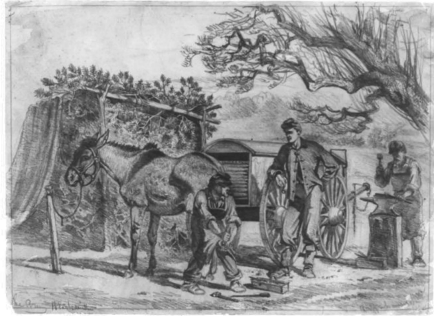
Acquiring and caring for mules consumed the time of both armies. Mules were needed to haul supplies and artillery along muddy roads.

"in charge of the mountain for a long time, their headquarters were at Tullahoma under Gen. Milroy."