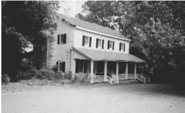
Northcut home and store in Beersheba Springs.

"This is the claim of a very amiable and industrious lady, who though she has married since the war, still she claims and exercises dominion over her own property without dispute. She attends to her own property and he to his, nothing of any claim to what came by the other. The children set up no claim to any of the property in this claim. The claim strikes me favorable except as to the weight of the hogs and the barrels of corn per acre, which strike me as rather heavy. Her witnesses are respectable."