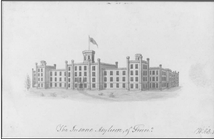
Tennessee Hospital for the Insane from AsylumProjects.org